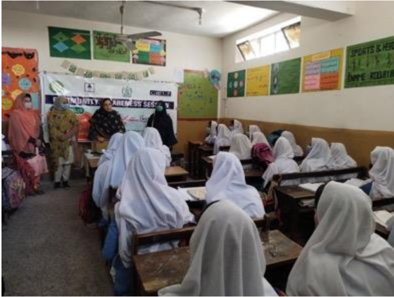
Children Immunization at Quetta (Funded by CHIP Consultants Pvt. Ltd.)