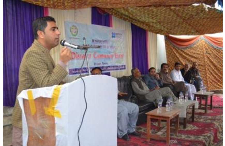
Take a Child to School Funded by British Council