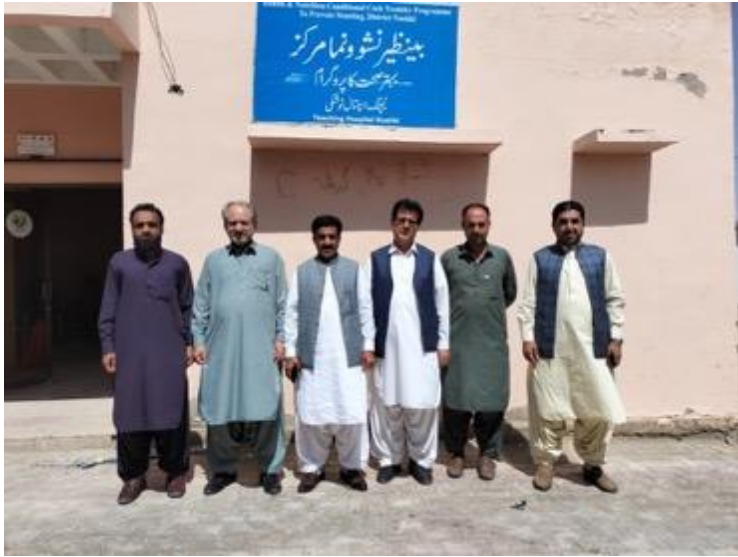
BENAZIR NASHONUMA STUNTING PREVENTION PROGRAM FUNDED BY UN-WFP