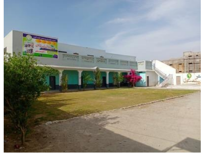
AZAT FOUNDATION PUBLIC SCHOOL, NUSHKI