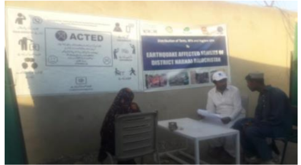
HARNAI EMERGENCY EARTHQUAKE RESPONSE-DISTRIBUTION OF NFIs IN COLLABORATION OF DISTRICT ADMINISTRATION AUTHORITIES FUNDED BY ACTED PAKISTAN