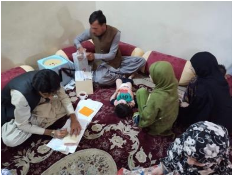
Annual Progress Report (July 2019-June 2022) Azat Foundation®